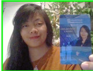
Candidate ID Card April 19, 2018 8:42:45 AM BNT, In-Test Photo