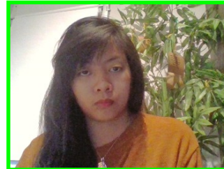
Un-announced Candidate Image Capture April 19, 2018 8:44:27 AM BNT, In-Test Photo