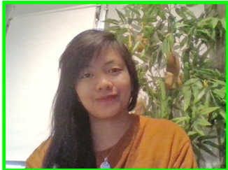
Candidate Image Capture April 19, 2018 8:40:25 AM BNT, In-Test Photo