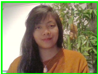
Candidate Image Capture April 19, 2018 8:46:42 AM BNT, In-Test Photo Timeout