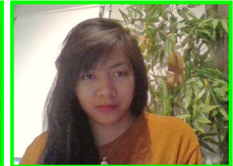
Un-announced Candidate Image Capture April 19, 2018 8:45:24 AM BNT, In-Test Photo